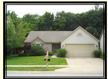
6921 Thousand Oaks Lane 3 Bedroom, 2 Bath Ranch Wayne Township $121,900