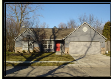
11216 Baywood Lane 3 Bedroom, 2 Bath Ranch Lawrence $124,900