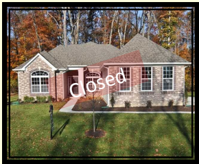
6704 Colville Place Lawrence