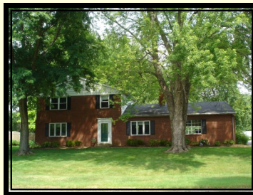
7847 N. Chester Avenue 4 Bedroom, 2-1/2 Bath 2-Story Washington Township $139,900