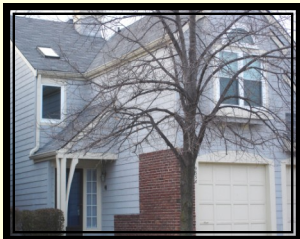
9354 Aberdare Drive Lawrence