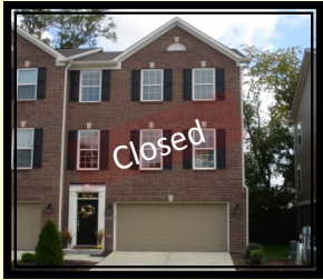
1010 N. Bard Lane Carmel