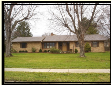
2850 Moller Road 3 Bedroom, 2 Bath Brick Ranch Speedway $124,900