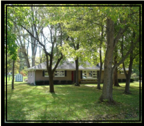
4903 E. 70th Street Washington Township