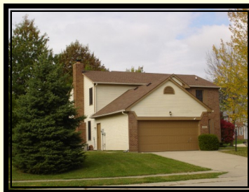
6350 North Meadow Circle 3 Bedroom, 2-1/2 Bath 2-Story Pike Township $129,900