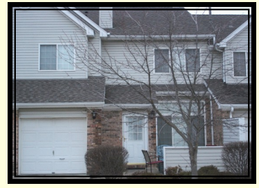
5714 Mornay Place 2 Bedroom, 1-1/2 Bath Condo Pike Township $77,500