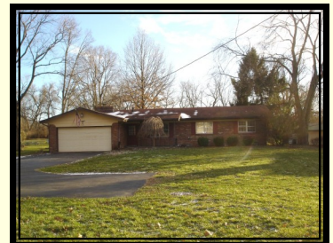
251 W. Hanna Avenue 3 Bedroom, 2 Bath Brick Ranch Perry Township $79,900