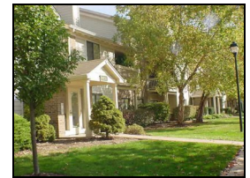
Pike Township 2 Bedroom, 2 Bath 8720 Yardley Court