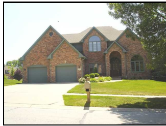
Greenwood 4Bedroom, 2-1/2 Bath 2-Story 5377 Crooked Stick Court $294,900