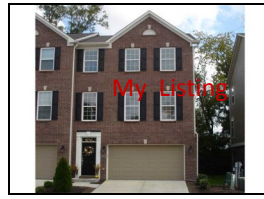
Carmel 2 Bedroom, 2-1/2 Bath 1010 Bard Lane