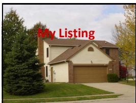
Pike Township 3 Bedroom, 2-1/2 Bath 6350 North Meadow