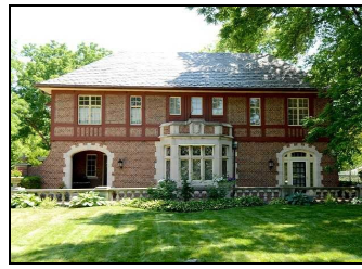
Washington Township 4Bedroom, 3.5Bath English Tudor 4409 N. Meridian Street $749,900