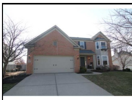
Westfield 4 Bedroom, 2-1/2 Bath 337 Tansey Crossing W.