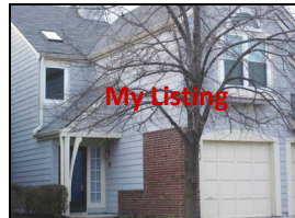
Lawrence 2 Bedroom, 2 Bath 9354 Aberdare Drive