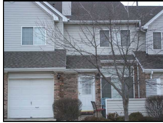
Pike Township 2 Bedroom, 1—1/2 Bath Condo 5714 Mornay Place $55,000