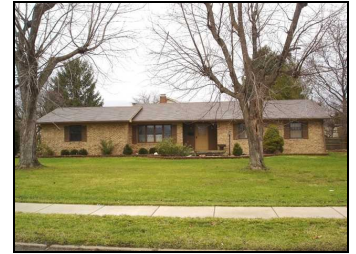
Speedway 3 Bedroom, 2 Bath Ranch 2850 Moller Road $114,900