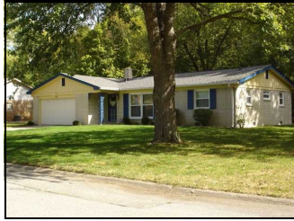
Pike Township 3 Bedroom, 1 -1/2 Bath Ranch 5945 N. Alton Avenue $107,900