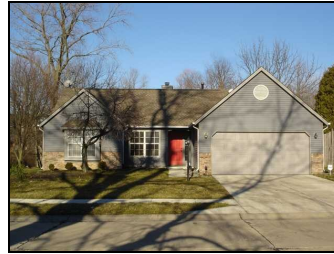
Lawrence 3 Bedroom, 2 Bath Ranch 11216 Baywood Lane $122,900