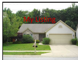
Wayne Township 3 Bedroom, 2 Bath 6921 Thousand Oaks