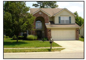
Carmel 3Bedroom, 2.5Bath 2-Story 13899 River Birch Way $194,900