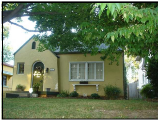
Washington Township 2Bedroom, 2Bath Bungalow 5321 Carrollton Avenue $164,900