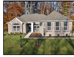
Lawrence 3 Bedroom, 2 Bath 6704 Colville Place