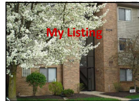
Pike Township 2 Bedroom, 2 Bath condo 4351 Village Pkwy Circle West