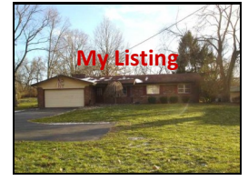
Perry Township 3 Bedroom, 2 Bath 251 W. Hanna Avenue