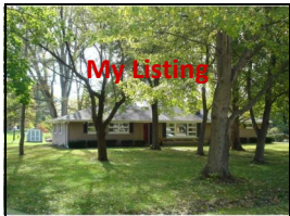
Washington Township 3 Bedroom, 1-1/2 Bath 4903 E. 70th Street